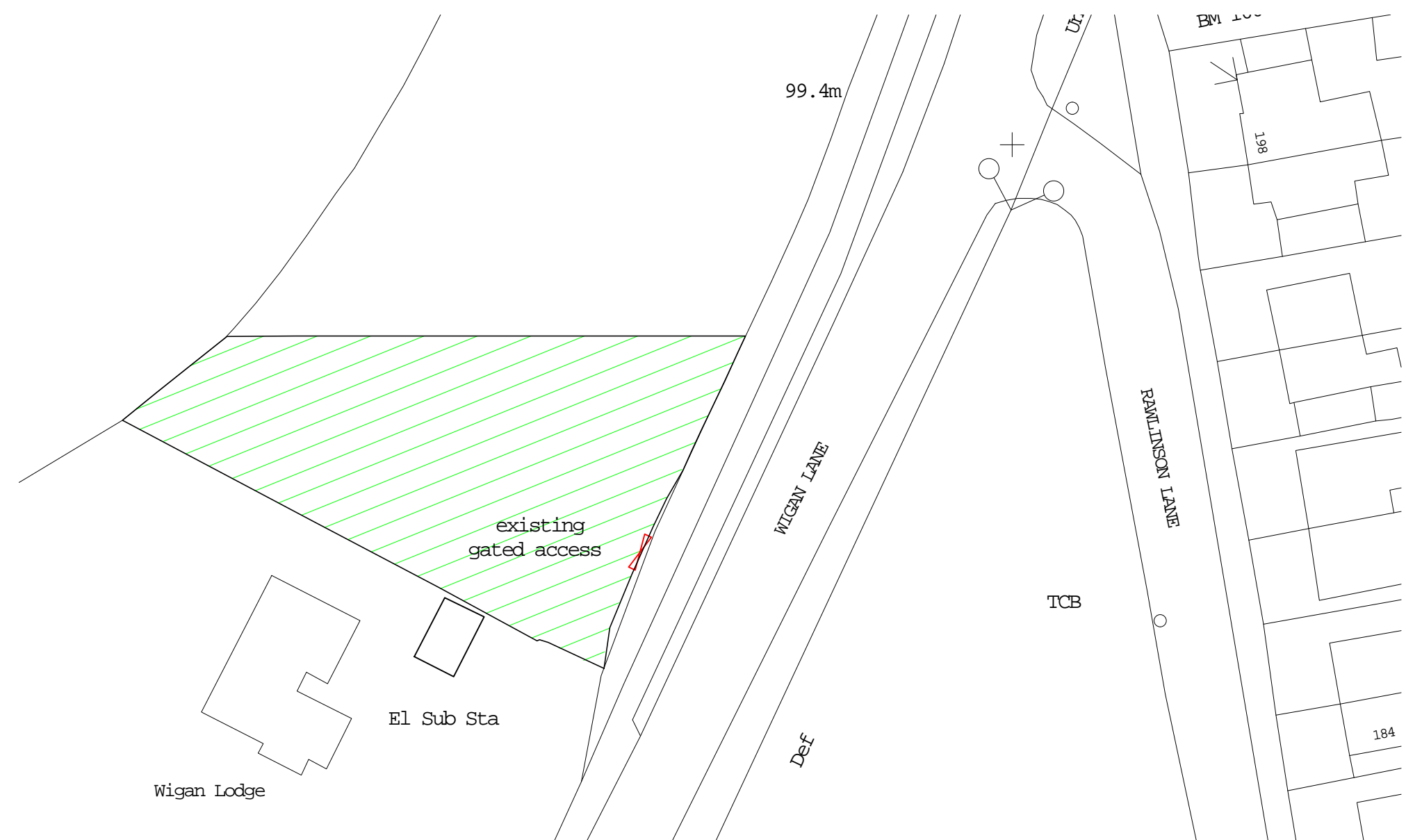
existing site plan (1:500)