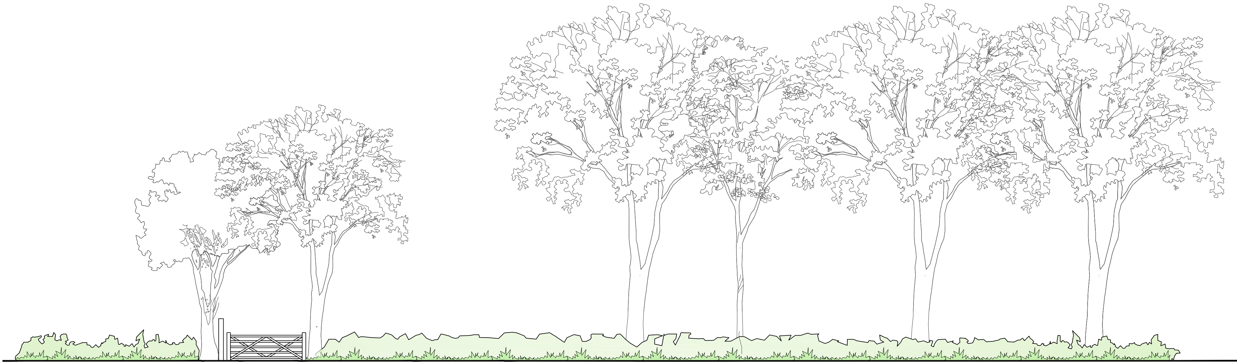
existing road (se facing) elevation