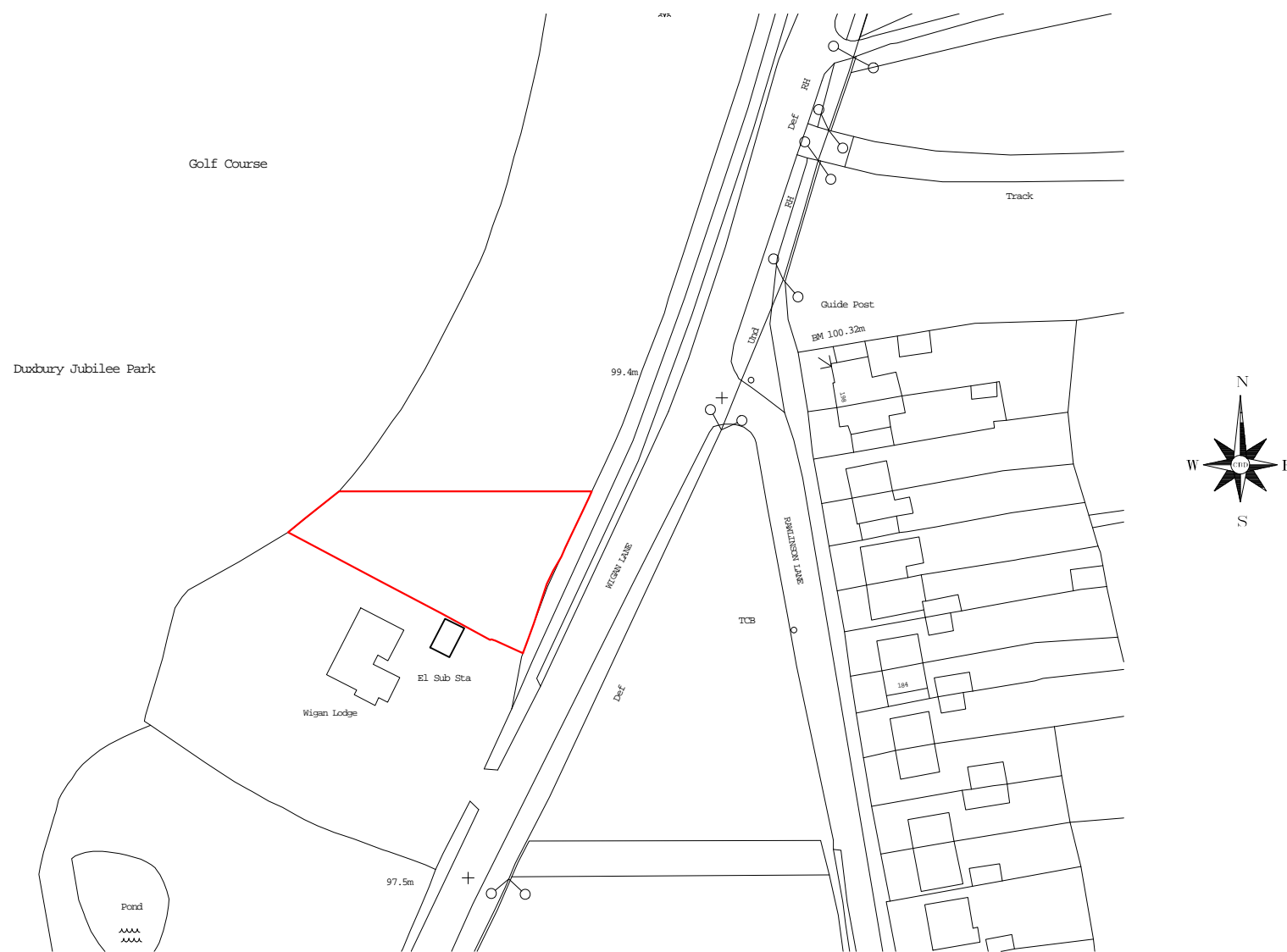
location plan (1:1250)